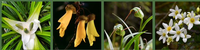
Seasonal Wonders Of The Waitangiroto