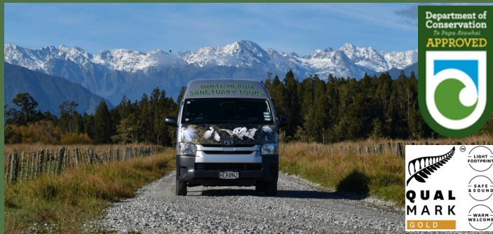
Stunning Views & South Westland Scenery