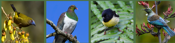
Observe The Kōtuku & Other Native Birdlife